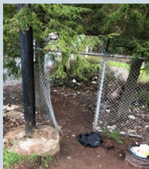
Above: Litter on the Marshall Campus prior to efforts by Benson Tech coaches and volunteers (including BPHSAA Board of Director members) to clear up and haul it away in time for the school's inaugural track and field invitational meet.