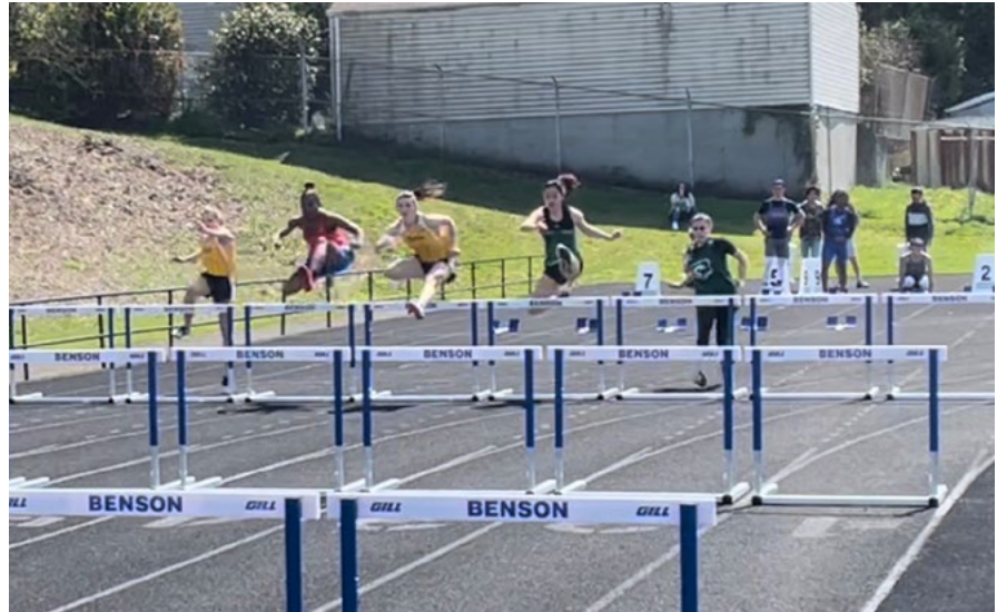
Above: Hurdle event held during the Benson Tech Invitational Meet held at the former Marshall High School Campus on April 23, 2022. Nine high school teams competed at the meet.