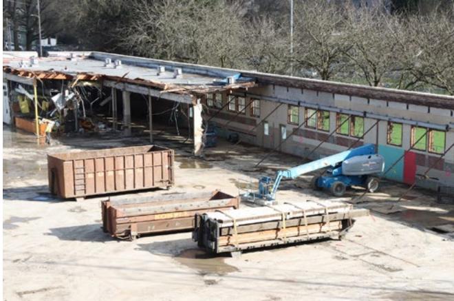
Above: Bound trailer loads of timber salvaged from demolition for Benson Tech modernization. They will be recycled for other uses.