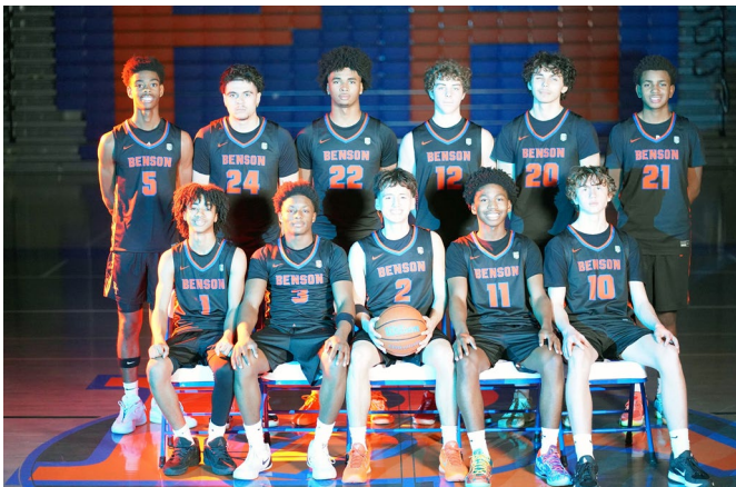
Top: Benson Tech's girls basketball team at the 2026 OSAA state championships. Bottom: The boys basketball team also competed in the OSAA state championships this year.

Benson Tech fell to West Linn in their semifinal game at the state tournament. The Astros went on to win their next game, defeating the defending state champs and top seed of the tournament, Tualatin. The girls were in high spirits as they accepted their third-place trophy.