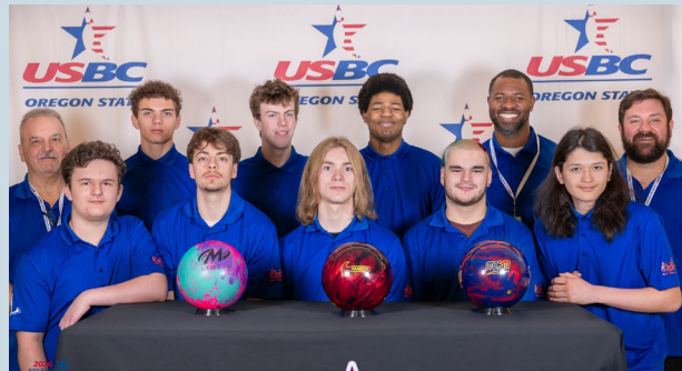
Above: Benson Tech's bowling team for 2025-2026