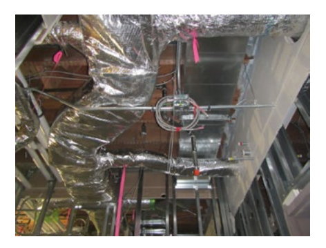
Left photo, top: View SW as construction crew works on seismic upgrades for the new roof system over the Old Gym. The upgrades are similar in scope to the roof replacement on the school's main building, Building E. Left photo, bottom: View from outside the auditorium, looking south down the hallway of Building E at ground level. The concrete floor is now in place and wall framing is in progress. Right photo, top: Progress on assembly of steel framing components for Building H. The view is SW and Buckman Field is off to the left. Right photo, second: The construction tent has been removed and the new roof is complete on the Building E. Right photo, third: View east from back side of the auditorium showing progress on Building B, located along Irving Street between the auditorium and new Building C. The lower level of Building B will house the New Band Room. Right photo, bottom: All new electrical, duct work and fire protection systems are underway in Building E.