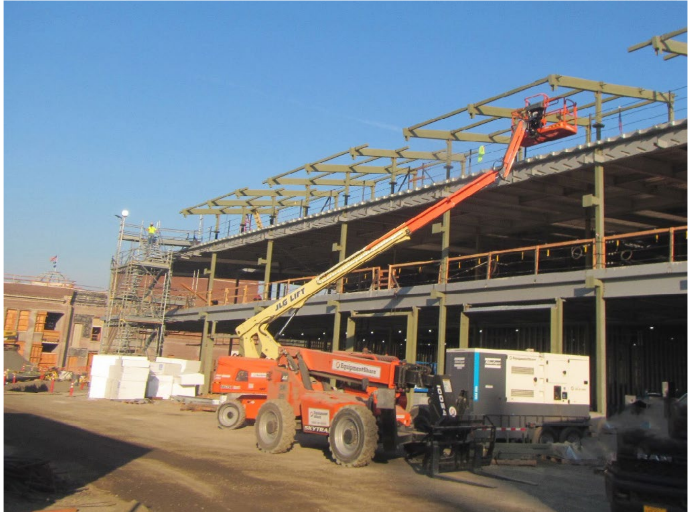
Above: View NW of the progress on Building C. Approximately 98% of the steel framing components are now in place. Solar panel brackets are visible along the roof edge. Solar panels will also be installed on portions of this south-facing exterior wall.

Installation of the necessary piping for the system is well underway and is presently mounted throughout the Building E. Additional hydronic piping is on site and is to be installed in a trench across the courtyard area to service the additional buildings.